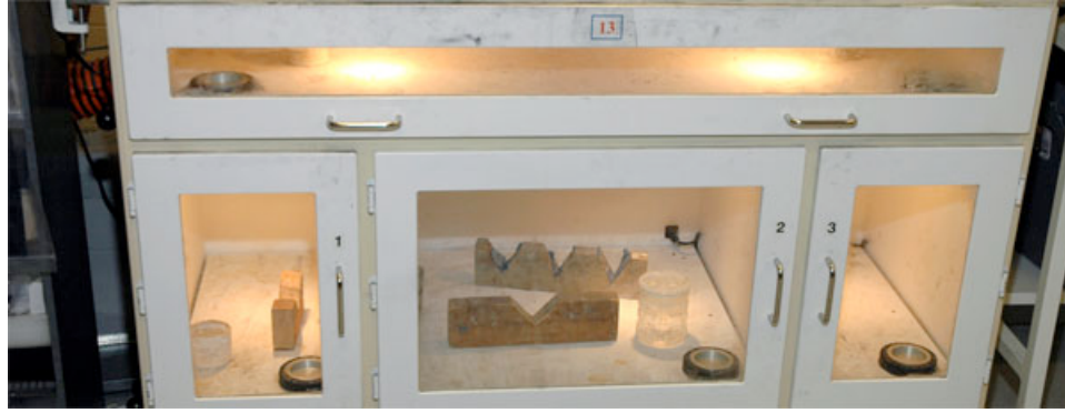
A chamber specially designed for exposing latent prints to super glue fumes.