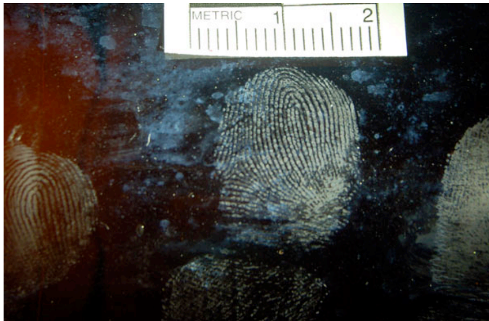
Super glue fumes adhere to latent fingerprints on the neck of a glass bottle.

Chemical Developers: Porous surfaces such as paper are typically processed with chemicals, including ninhydrin and physical developer, to reveal latent fingerprints. These chemicals react with specific components of latent print residue, such as amino acids and inorganic salts. Ninhydrin causes prints to turn a purple color, which makes them easily photographed. DFO (1,2-diazafluoren-9-one) is another chemical used to locate latent fingerprints on porous surfaces; it causes fingerprints to fluoresce, or glow, when they are illuminated by blue-green light.