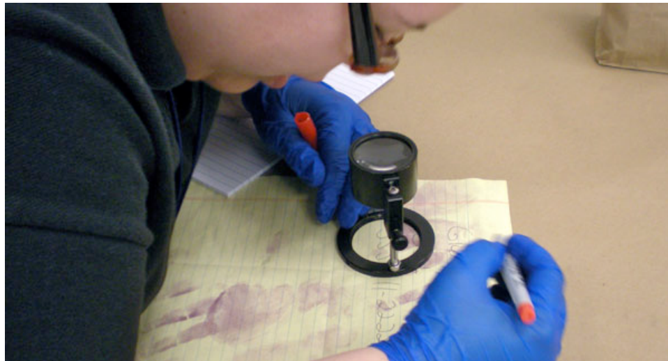
An examiner uses a loupe to view minute details of a fingerprint.

Fingerprint examination involves looking at the quality and quantity of information in order to find agreement or disagreement between the unknown print (from the crime scene) and known prints on file. To conduct the examination, fingerprint examiners use a small magnifier called a loupe to view minute details (minutiae) of a print. A pointer called a ridge counter is used to count the friction ridges.