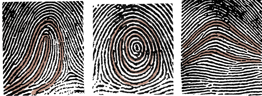
Loop, whorl & arch pattern examples.

The fingerprint pattern, such as the print left when an inked finger is pressed onto paper, is that of the friction ridges on that particular finger. Friction ridge patterns are grouped into three distinct types—loops, whorls, and arches—each with unique variations, depending on the shape and relationship of the ridges: